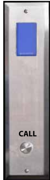
Figure 2 Hall Call Station

In the event of a building power failure, the door system is provided with a temporary power back-up system to continue the opening operation for a number of times. On resuming normal building power, the back-up system will turn OFF and begin automatically recharging.