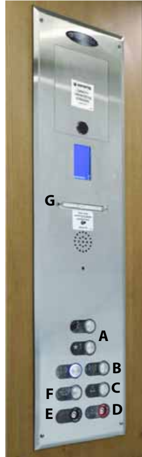
Figure 1 Keyped COP

This button can be pressed at any time to activate the optional hands-free phone in case of an emergency. The red light above the speaker will come on when two-way communication has been established. For units that have a standard hand-held phone, it is located in a separate phone cabinet in the cab.