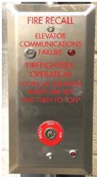
Figure 3 Phone Monitor

NOTE: There is an alarm silence key provided to turn off the beeper.