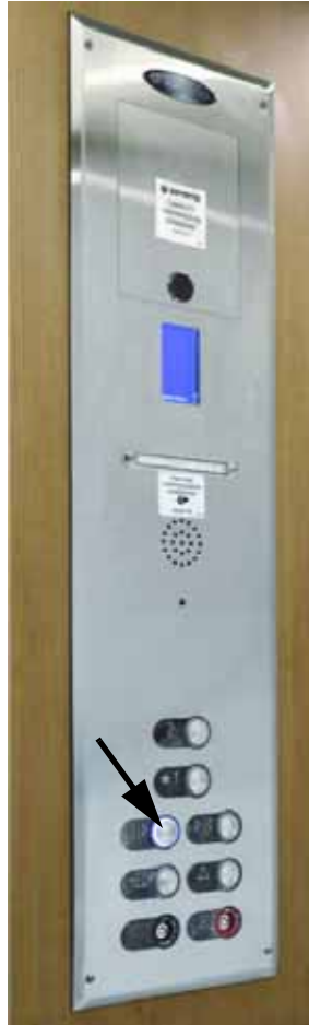
Figure 3 Door Open Button

When the elevator is at a landing level, the doors can be opened by pressing the Door Open button. Normally the doors will have opened and already closed automatically. The Door Open button allows the door to be reopened.